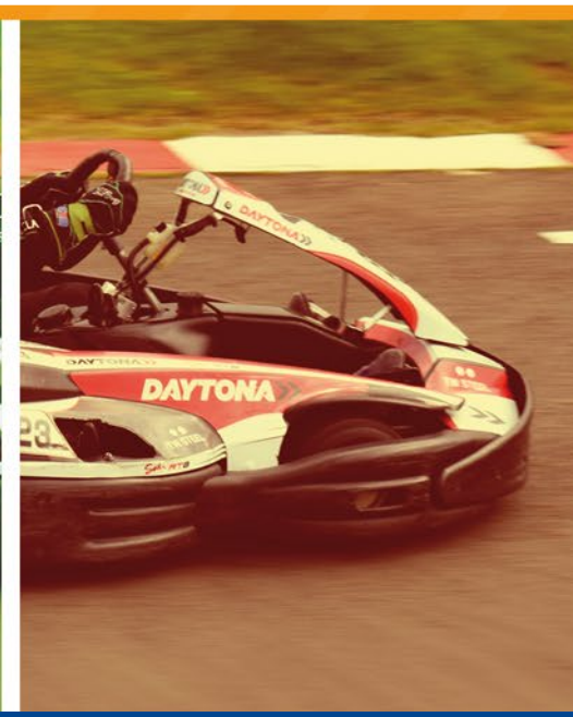
Get karter: the hotly contested Broker200 kart race saw 20 teams of racers raising over £6,000 for charity this year