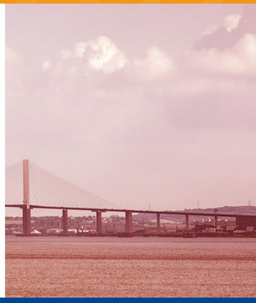
The Dartford Crossing: penalty charge notices for non-paying users are processed more efficiently, thanks to the Rental Committee