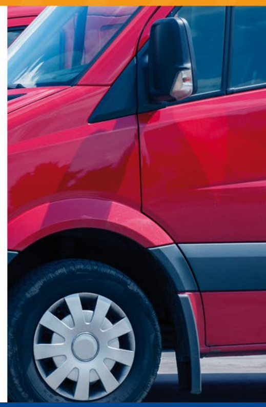
Growth: more than 300,000 new vans have been registered this year, with BVRLA members responsible for 750,000+ vans and trucks