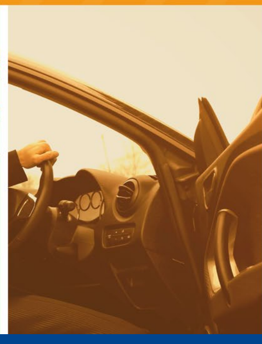
Action stations: the BVRLA has marshalled data to present the business case for the company car following government 'attacks'